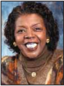
Rep. Stephanie Tubbs-Jones