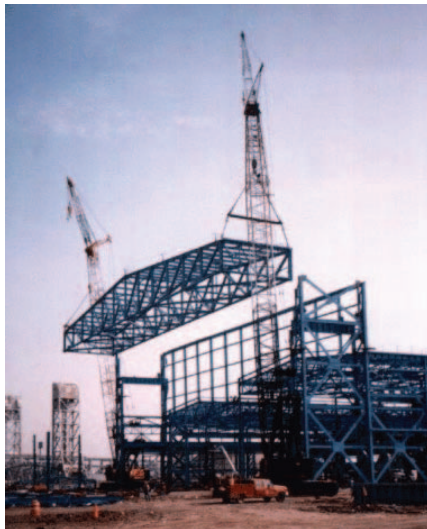
Dual Crane Lift

There are many definitions of a critical lift used in the construction industry. NIOSH defines a critical lift as one with the hoisted load approaching the crane’s maximum capacity (70% to 90%); lifts involving two or more cranes; personnel being hoisted; and special hazards such as lifts within an industrial plant, cranes on floating barges, loads lifted close to power-lines, and lifts in high winds or with other adverse environmental conditions present. The U.S. Army Corps of Engineers also defines a critical lift to include lifts made out of the view of the operator (blind picks), lifts involving non-routine or technically difficult rigging arrangements, and any lift which the crane operator believes is critical. The Construction Safety Association of Ontario also includes lifts in congested areas, lifts involving turning or flipping the load where “shock loading” and/or “side loading” may occur, lifts where the load weight is not known, lifts in poor soil or unknown ground condition, and lifts involving unstable pieces. The Department of Energy further defines a critical lift to include lifting high value, unique, irreplaceable, hazardous, explosive, or radioactive loads. The definition of a critical lift is not as important as the planning necessary to safely perform the lift.