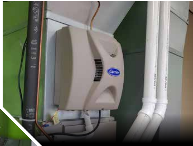
Humidifiers can provide both comfort and savings to customers in the winter time.