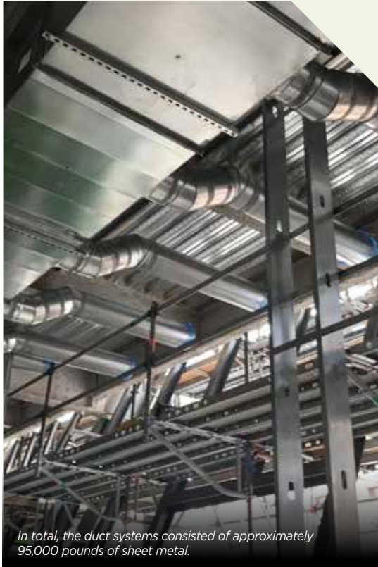
In total, the duct systems consisted of approximately 95,000 pounds of sheet metal.

Today, SMCA has grown beyond bargaining to include a wealth of education, training and business-management resources. Importantly, the Association's companies are more committed than ever before to construction safety and effective labor relations, all of which are fostered by the top-level services that SMCA continues to provide, as it has for a century.