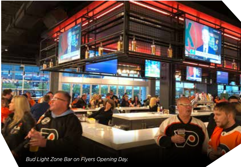
Bud Light Zone Bar on Flyers Opening Day.