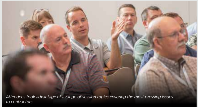
Attendees took advantage of a range of session topics covering the most pressing issues to contractors.