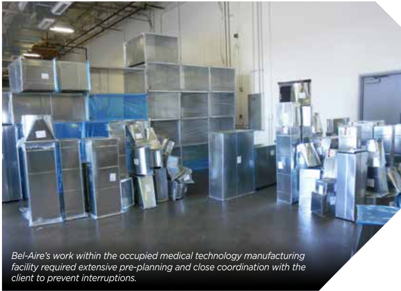
Bel-Aire's work within the occupied medical technology manufacturing facility required extensive pre-planning and close coordination with the client to prevent interruptions.