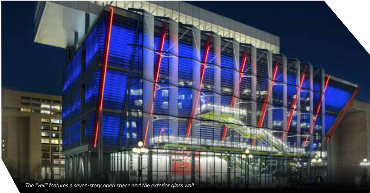
The "veil" features a seven-story open space and the exterior glass wall.