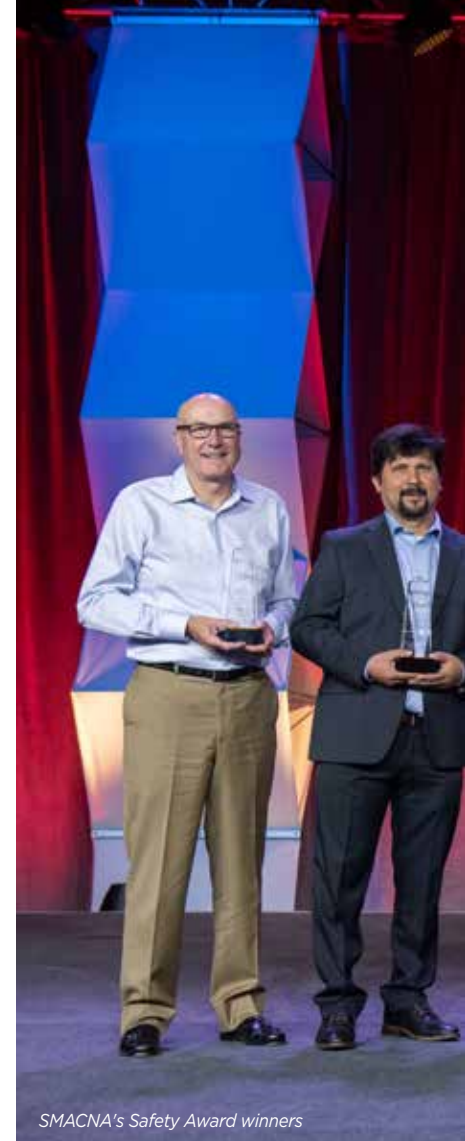
SMACNA's Safety Award winners

The session examined project risks contractors can expect to face now and into the future, including retaining a skilled workforce to meet growing demand, post-pandemic supply chain disruptions and calamitous contracts, to name a few.