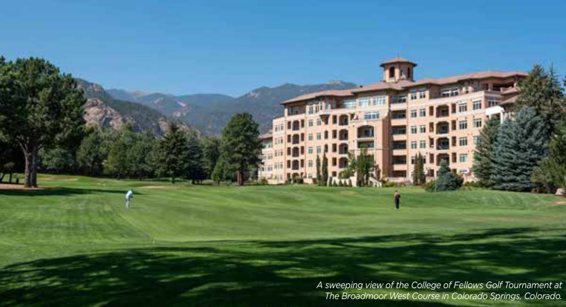
A sweeping view of the College of Fellows Golf Tournament at The Broadmoor West Course in Colorado Springs, Colorado.

all updates in the same project management location can streamline the process.”