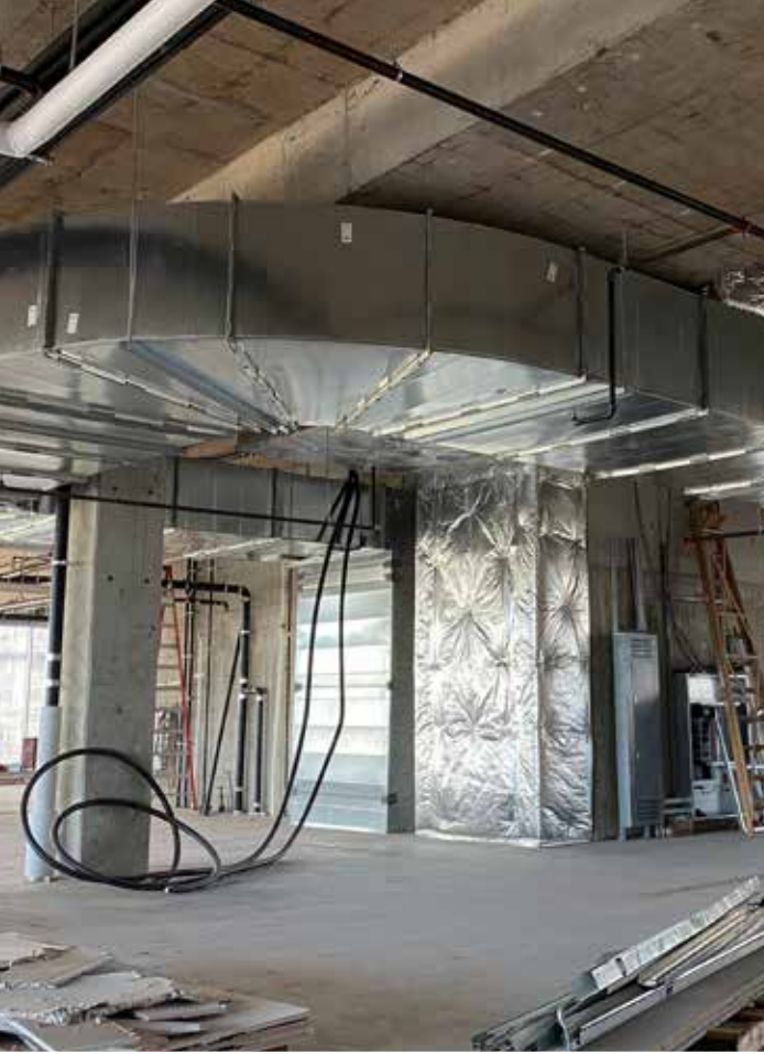
Summit Sheet Metal Ltd. installs complete HVAC systems for high- and low-rise residential buildings — all without having their own shop for fabrication.

"WE CAME TO REALIZE THAT OWNING A SHOP IS ALMOST LIKE OWNING A SECOND COMPANY, AND IT HONESTLY JUST DIDN'T MAKE SENSE FOR US."